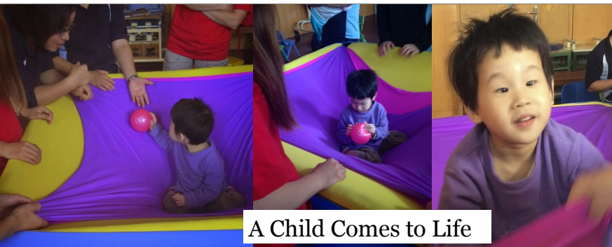
A Child Comes to Life